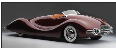
1948 Buick Streamliner