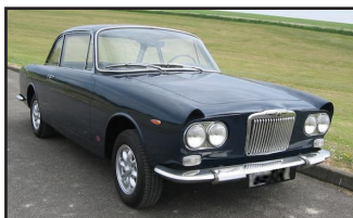
1964 Sunbeam Venezia by Carrozeria Touring