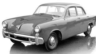
1952 Porsche 542 "Studebaker"