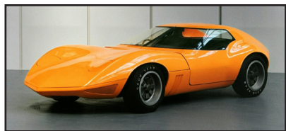
1966 Vauxhall VXR Prototype