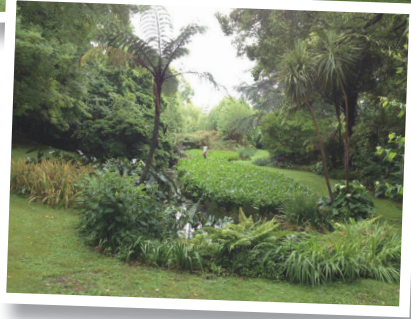
Side Curtains February 2015