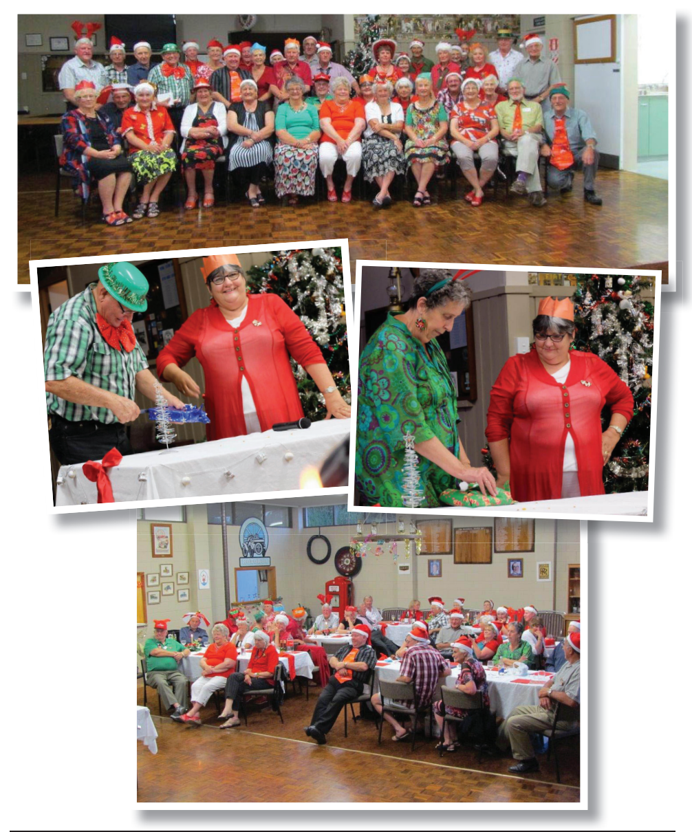
Side Curtains February 2015