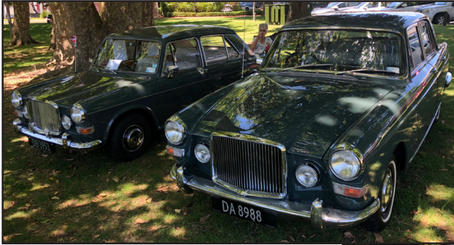
Vanden Plas Princess 1100 and 4 Litre R