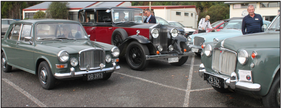
Below: Some of the cars that took part on the run