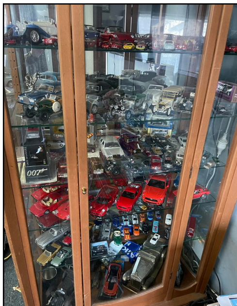
Some of the Editor's models...

My collection grew in the 1980s and 1990s, a period of great interest in model collecting and many swapmeets to attend to grab that elusive bargain. Many are Dinky Toys but other makes meant I was able to obtain models of most of the cars I have owned, even a Vanden Plas Princess 1100, but no-one seems to make a model of the 1935-1938 Series I or II Morris Eight! I also have a cabinet full of a wide range of Rolls-Royces and Bentleys, but draw the line at models of examples from after the end of the 20th century - current R-Rs do not have the styling appeal for me of “real” R-Rs!