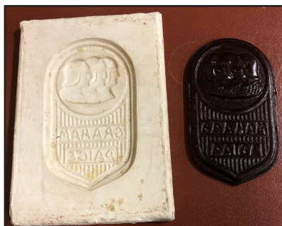
Doug Green's mould and tail light

I hope to see many of you at club night in October and at the many other branch activities between now and Christmas. And get your car(s) ready for the Lakefront Car Show in January!