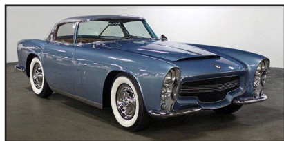
1953 Dodge 'Zeder' Storm Z-250 by Bertone