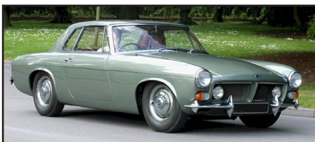
1965 Jensen P66 prototype