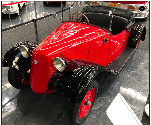
1933 Tatra 57