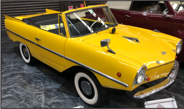
Amphicar Model 770