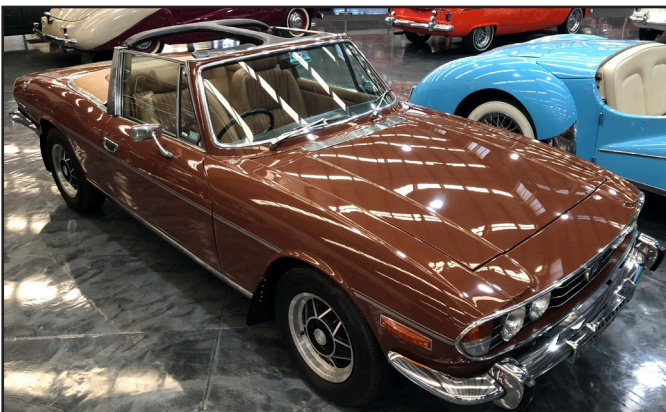
Triumph Stag (in a very 1970s colour)