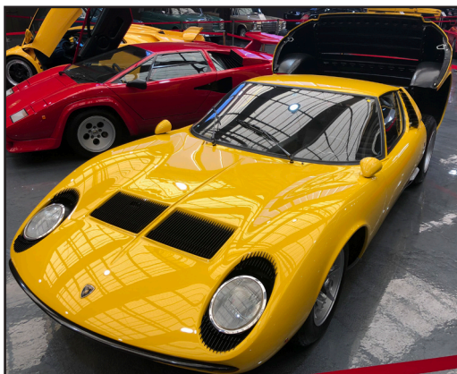
1968 Lamborghini Muira