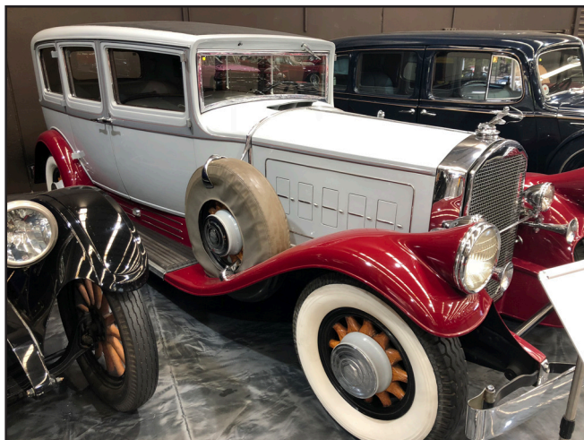
1931 Pierce-Arrow A-144